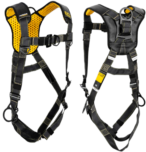
2 FBH, 3D, FD, MB Chest/Legs