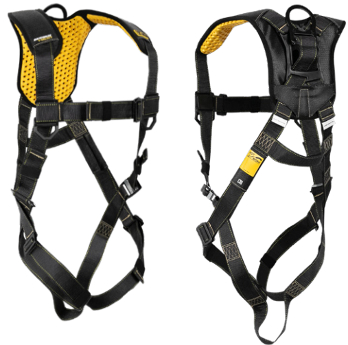
4 FBH, 1D, MB Chest/Legs