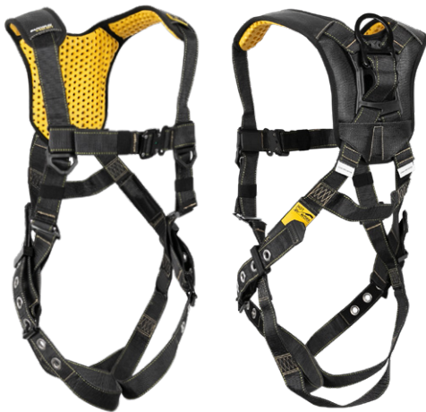
3 FBH, 1D, QC Chest, TB Legs