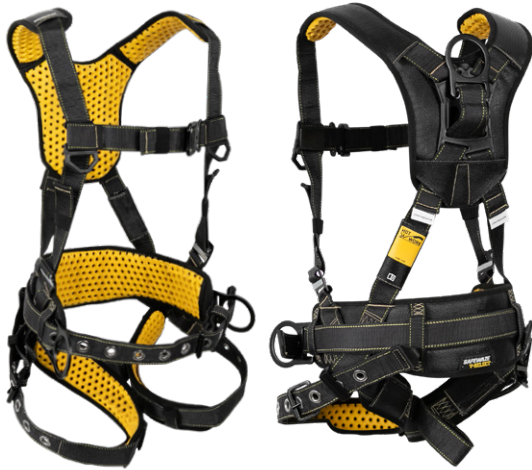
1 CH, 3D, QC Chest, TB Legs

Weight Capacity: ANSI 130-310 lbs.; OSHA 420 lbs. ANSI Standards: Z359.11-2021 OSHA Standards: 1926.502, 1910.140 40 Cal rated aramid webbing Char rating 600 degrees