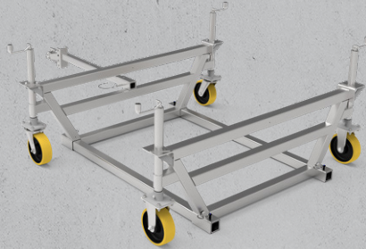
XLT Wheeled Accessory #A5039-72

The four wheels are equipped with a cranking mechanism to lift and position the full XLT assembly.