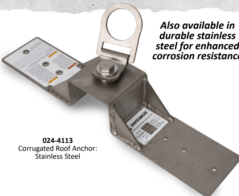
024-4113 Corrugated Roof Anchor: Stainless Steel

Also available in durable stainless steel for enhanced corrosion resistance