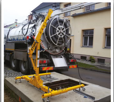
Mobile "H" Base

XTIRPA systems support America's trade professionals wherever they work: