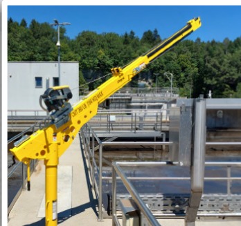
96" Davit Arm