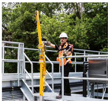
24" Davit Arms