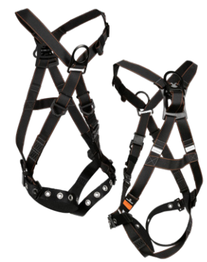
11 1D QC Torso FD TB Legs