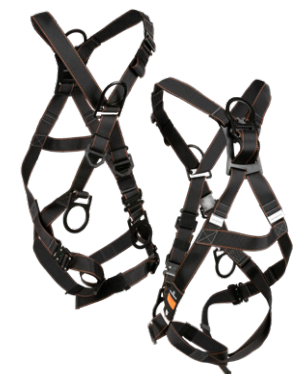
12 3D QC Torso FD QC Legs

XS/S: 022-1084 M/L: 022-1085 XL/2X: 022-1086 3X: 022-1087