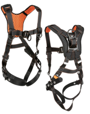
10 1D, MB Chest, FD, TB Legs