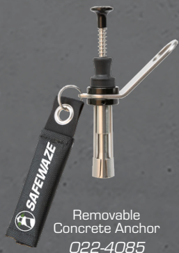
Removable Concrete Anchor 022-4085