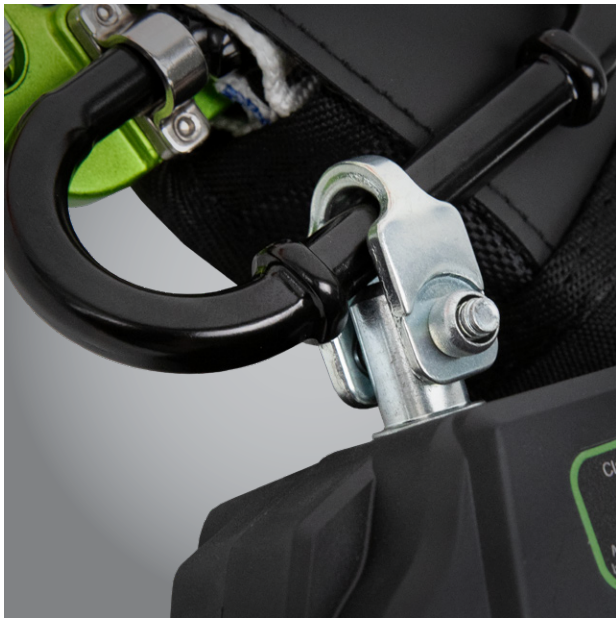
360/180° attachment point offers full range of motion for increased efficiency