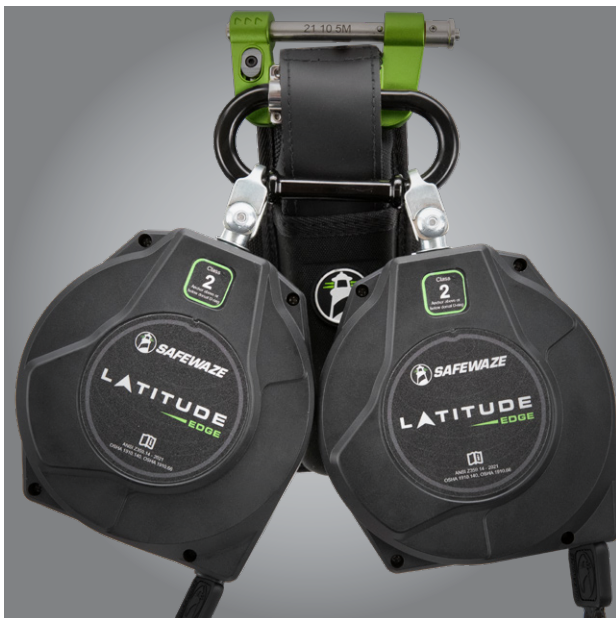
Exclusive dorsal attachment bracket with SRL separator feature