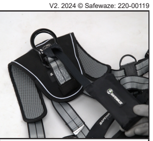
E: Pull on the pack of the Suspension Trauma Steps until the webbing is tightly fixed to the dorsal D-ring bar.