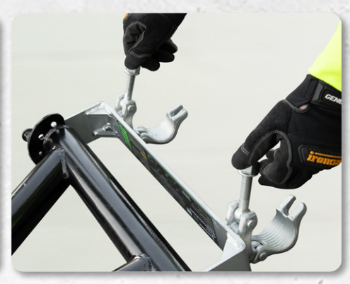
Installs quickly directly to vertical post with just two clamps