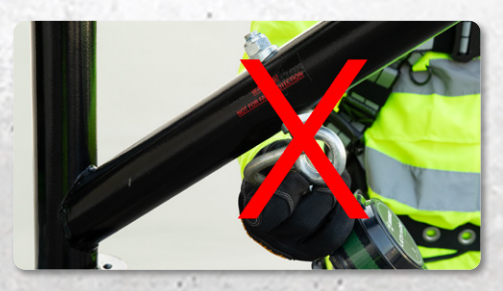
NOTE: Lower eyelet is not for fall protection