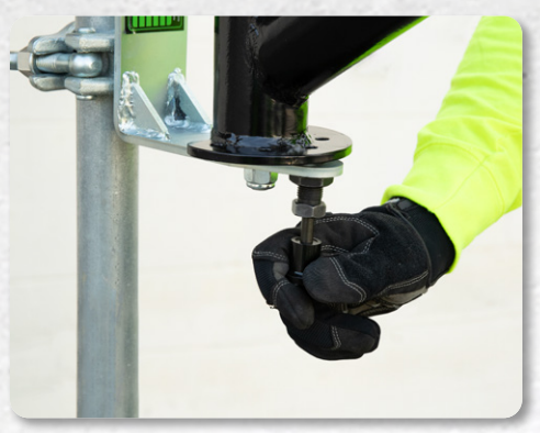
Easy one-handed operation to pivot davit arm

Reduce swing fall hazards with our pivoting system by positioning the anchor point directly overhead.