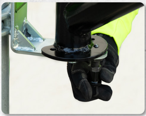
Arm locks securely in place to prevent movement during use