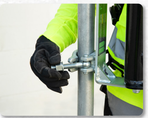
Flexible mounting locations clamps directly to vertical, supported scaffolding