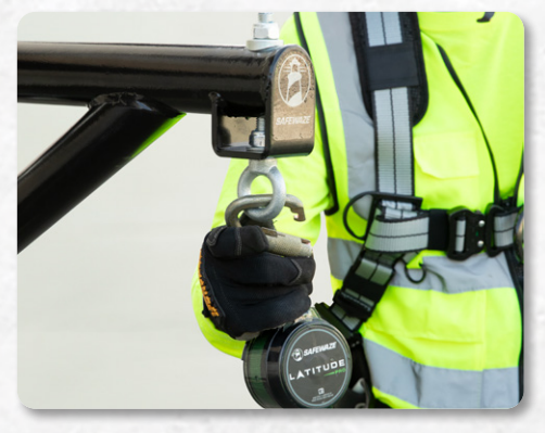
Use for either fall arrest or fall restraint with the appropriate SRL or lanyard