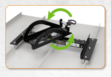
360° swivel base for increased user mobility