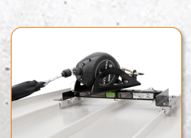
Smart cradle design accommodates most SRL sizes