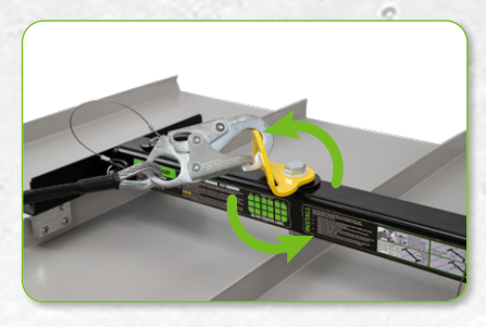
360° swivel D-ring for increased user mobility