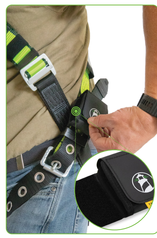
Securely attaches in seconds with Velcro to torso webbing on most harnesses