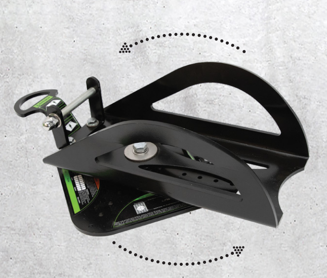
360° base rotation