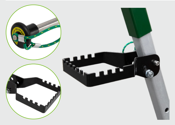
Tripod Step with firm footing safely increases reach to anchor points*