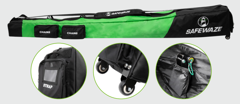
Heavy-duty storage bag with wheels for easy transport, multiple handles, padded shoulder strap and labeled pockets for organization (inlcuded with all kits)