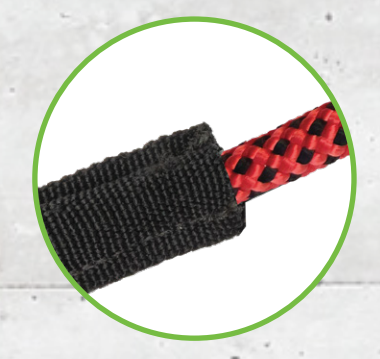
Protective nylon wear sleeve for long-lasting use