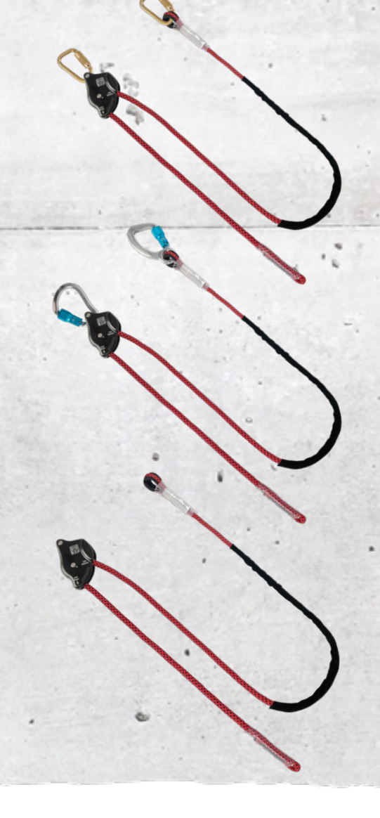
021-2064 Durable steel carabiners