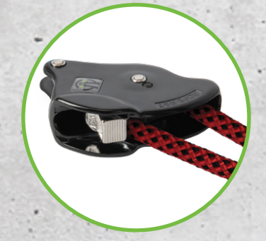
Recessed release for added safety