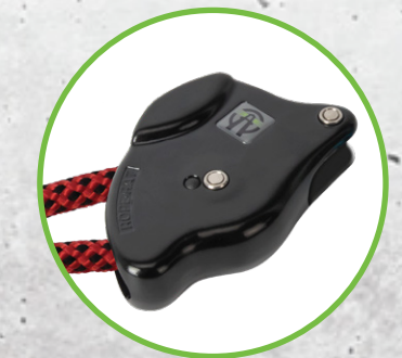
Easy positioning rope adjuster for one-handed operation