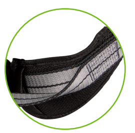
Removable Leg Pads provide added comfort and extended product life