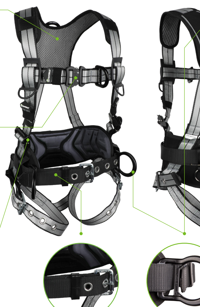
Removable Waist Belt on construction models allows flexibility to add tool bags or pouches