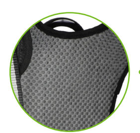
Advanced Technology delivers breathable, moisture-wicking comfort in waist and shoulder padding