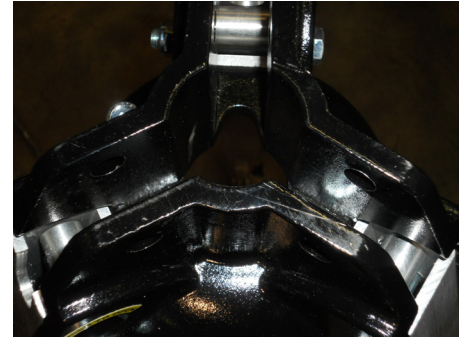
(Top of tripod with pulleys removed)