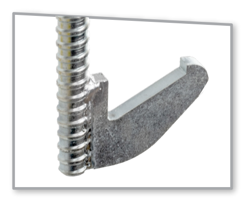
Rebar loop hook with adjustable thread bars