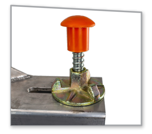
Rebar safety caps