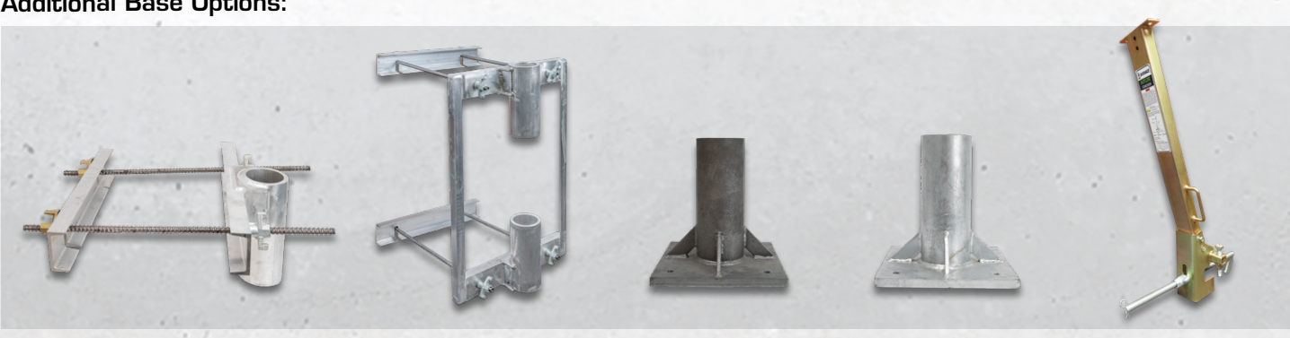
Form Link Anchor Fits cage #7 rebar or larger (FS-EX2502)